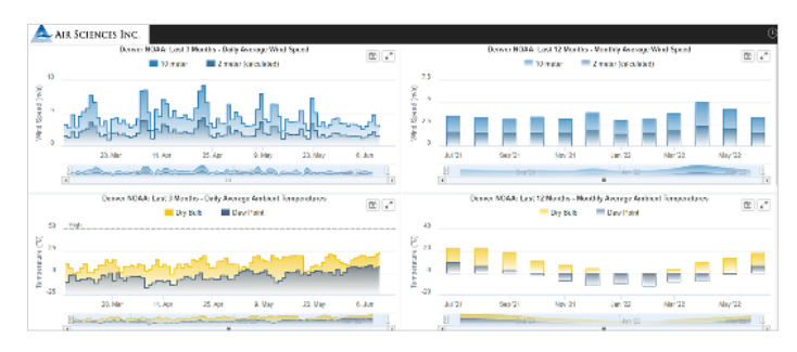
eagle.io dashboard that shows average wind speeds and temperatures.