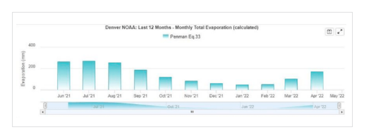
A user-friendly dashboard that calculates theoretical total evaporation using publicly available NOAA meteorological data.