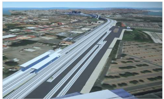
OpenRail, OpenRoads, and OpenCities Map improved accuracy by allowing designers to integrate track, civil, and GIS data in a single design format.

Bentley ® FIND OUT MORE AT BENTLEY.COM Advancing Infrastructure