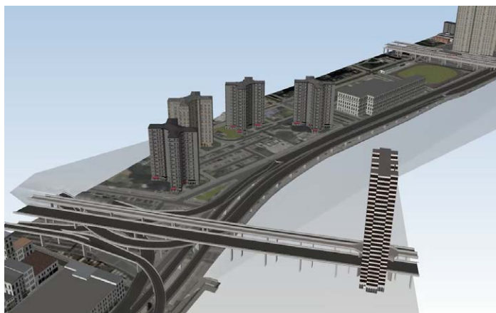
Clear visualization has lowered the time needed for identifying and resolving clashes from 24-32 hours to 8-12 hours, per preliminary data.