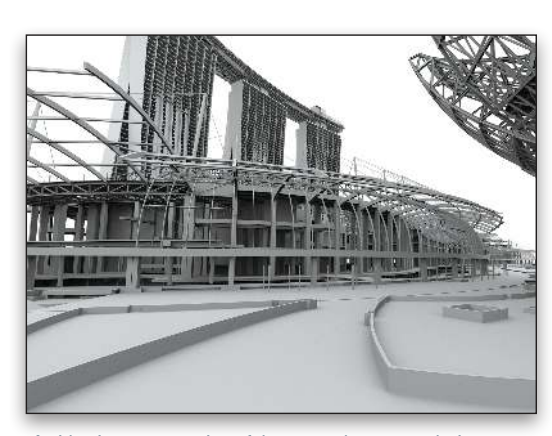
A side view perspective of the monochrome rendering produced using Structural Modeler.

In order to deliver a project of such scale, the Singapore office enlisted the help of other Arup locations, so that designers in Boston, Hong Kong, Melbourne and Singapore could work concurrently on different parts of the model. The involvement of all the offices presented a challenge in itself, with regard to model setup, dataset management, and project coordination. The interoperability of Bentley's technology, however, enabled Arup to effectively integrate a design team distributed over multiple locations.