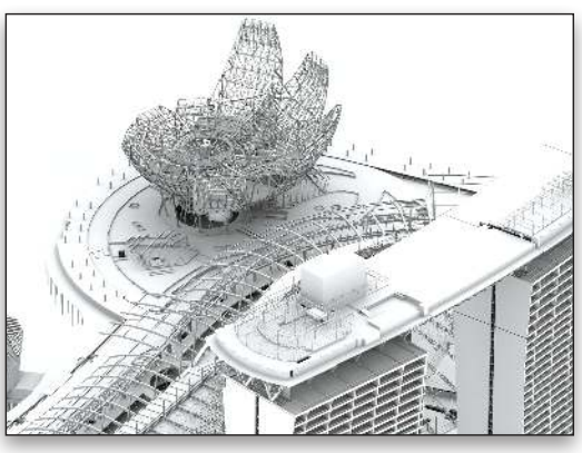
An aerial perspective view of the monochrome rendering.