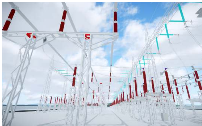
OpenUtilities and OpenBuildings digitalized workflows to save 50% in design time, while working in a digitally connected environment reduced design changes by 60%.