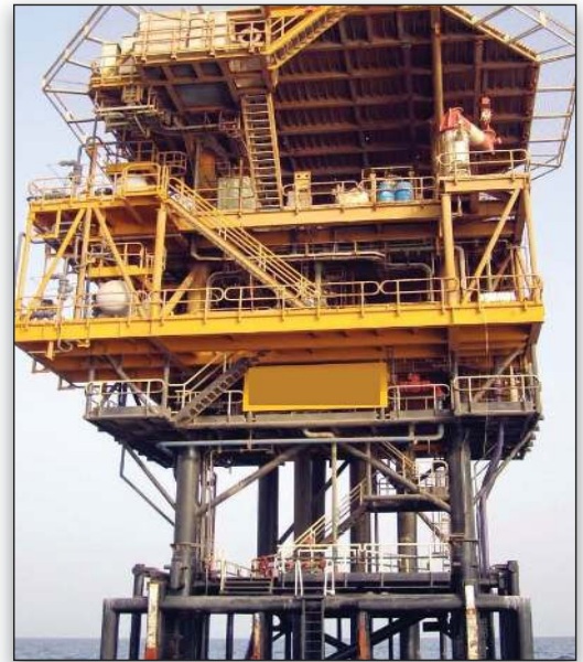
SACS simulations allowed the company to substantiate the insurance claim resulting from the accident, saving the operator considerable costs.

The platform was repaired, and structural integrity was restored, so that the wellhead could be certified for operation and reinstated into production in line with Health & Safety Environment (HSE) requirements. The understanding of post-impact behavior gained from SACS analyses helped to execute the stage-wise release of the platform so that