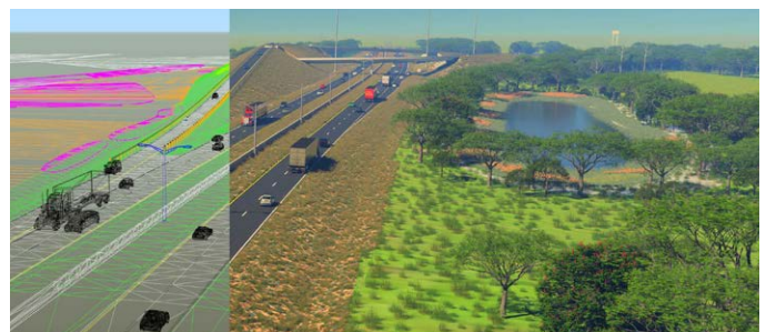
Create lifelike visualizations using the built-in VUE rendering engine.

You can automate the production of high-quality drawings, including multidiscipline documentation sets, that are consistent across an entire project. Powerful documentation automation capabilities, including MicroStation's unique ability to leverage embedded properties and BIM information, are time savers and a bridge to leveraging BIM models for deliverable production. The advantages span from property-driven annotation, display, and reports to sheet layout and indexing.