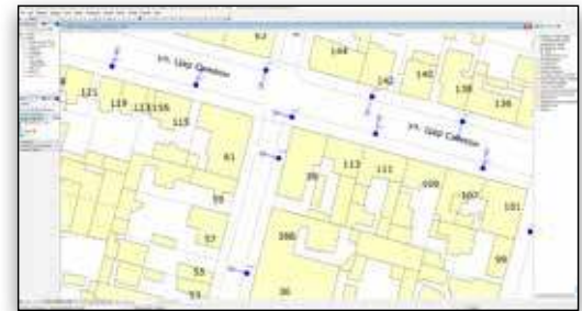
DAVID Holding used OpenUtilities Designer to map out and manage the street lighting infrastructure in Sofia, Bulgaria.

To satisfy the main objective of the project, the company required standard applications, commercial products, and software tools; an open architecture design that allowed for future extension and development; secure data creation, modification, and management; and uniform workflows within a standardized environment. DAVID Holding accomplished