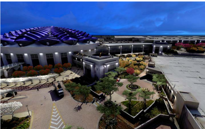
Khatib & Alami captured 330,000 images with UAVs and constructed a 3D reality model of the area, which included 43,000 fully textured buildings.

kilometers to 280 square kilometers, all within the same 14-day deadline. While the original plan was to achieve a GSD of 10 centimeters and a DSM accuracy of 20 centimeters, the result had both a GSD and DSM accuracy of 5 centimeters, in some cases ranging up to a 2 centimeter accuracy. By automating the vectorization process for building textures, they were able to fully texture the 43,000 buildings in just 30 days. Even with the greatly improved results, Bentley applications helped Khatib & Alami save time and costs during the design process. Automation allowed them to reduce resource hours, saving USD 150,000. Additionally, the team finished the project in just 90 days rather than the 125 days budgeted, which lowered costs by another USD 48,000. The cost savings are now passed onto the Oman government, as they are leveraging the digital twin for complex scenario planning and optimized solutions that keep the country secure and prepared for any potential disruption to regular life.