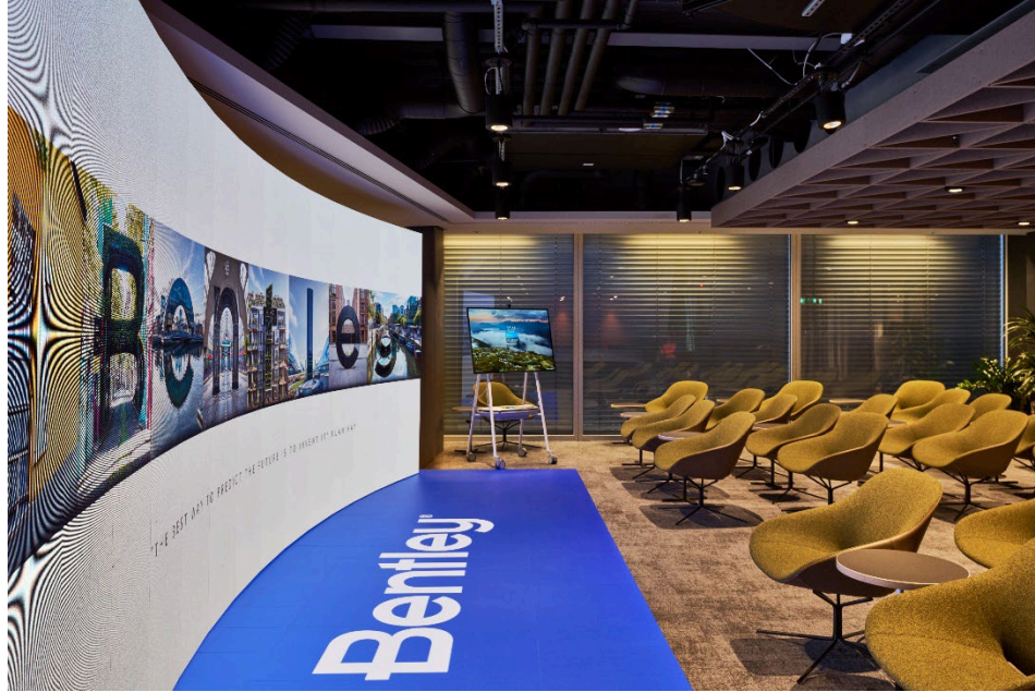
Caption: Bentley Systems UK Headquarters includes an interactive experience center.